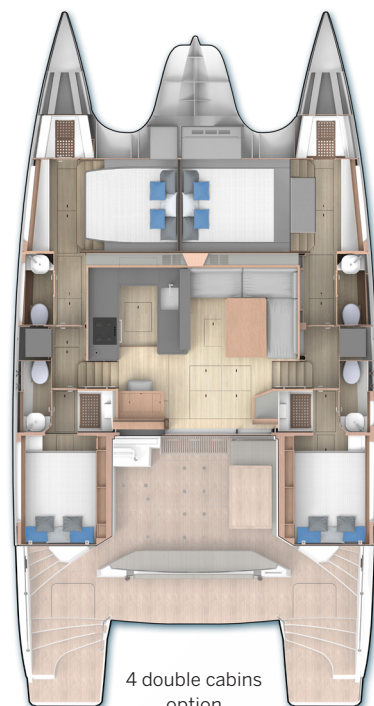
4 double cabins option