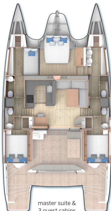
master suite & 3 guest cabins option