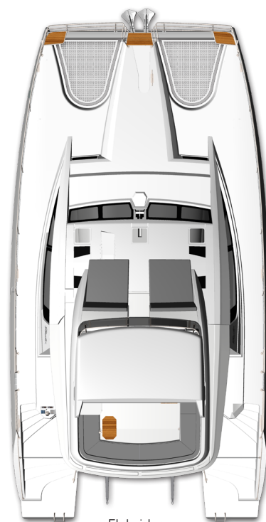
Flybridge T-Top option