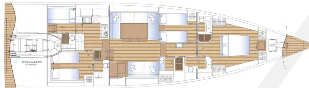
ALTERNATIVE INTERIOR PLAN