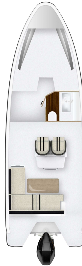
STANDARD Storage & Head