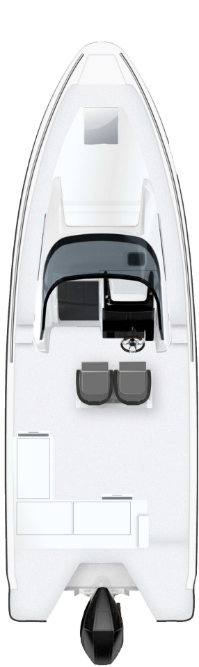
STANDARD Fiberglass deck