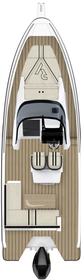
OPTION Table, wetbar, bench & bow upholstery