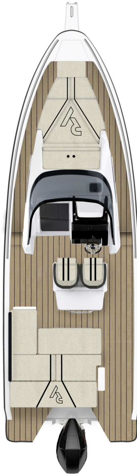
OPTION Back rest lower & raise, wetbar