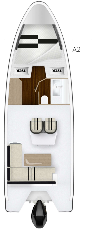
OPTION Cabin & Head